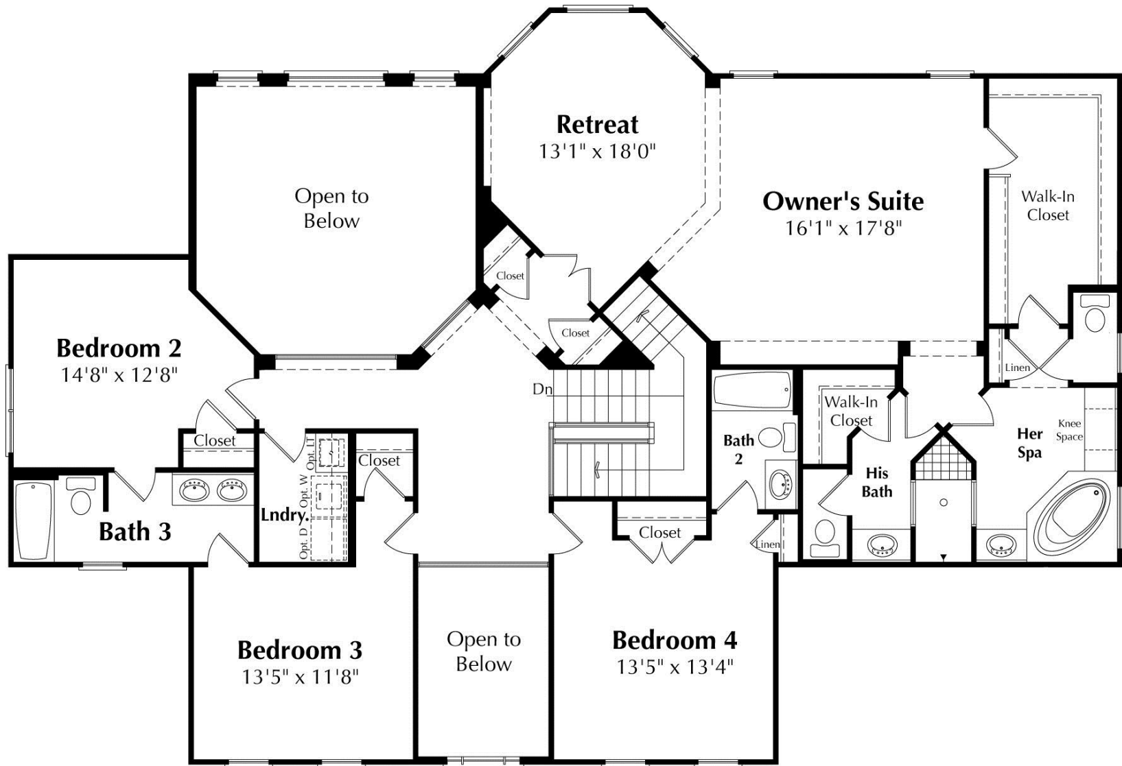
Second Level Floor Plan