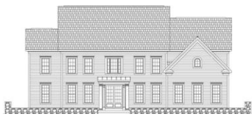
Front Elevation Number 1