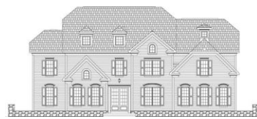
Front Elevation Number 4