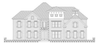
Front Elevation Number 5

Details and dimensions shown on these floor plans are approximate and subject to change. Illustrations are artists' concepts and may vary in detail from plans and specifications.