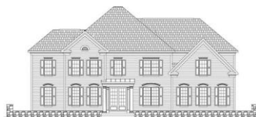
Front Elevation Number 2