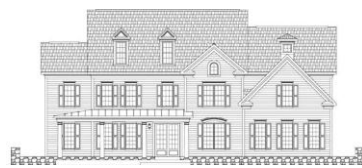
Front Elevation Number 3